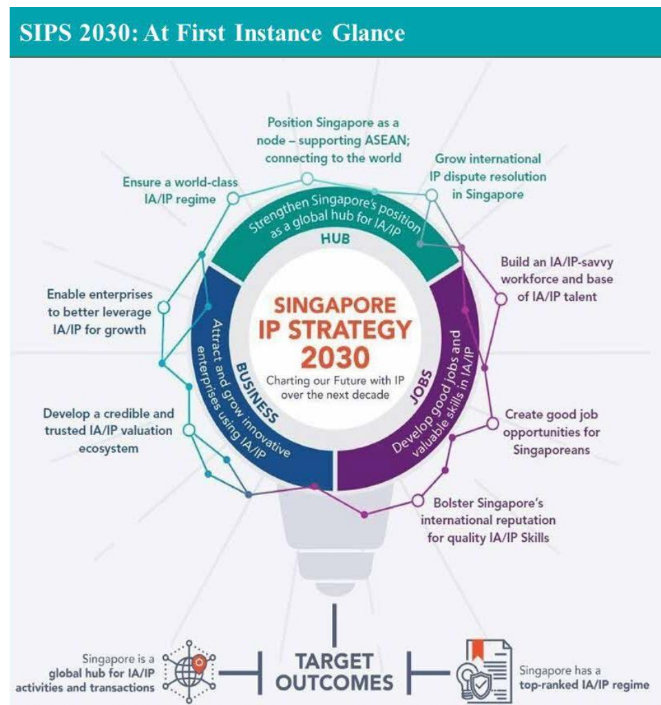
Exhibit 1: The Singapore IP Strategy 2030

Standardised information will allow stakeholders to make more informed assessments of the business and financial prospects, thereby facilitating the commercialisation of the intangibles. In addition, harmonised disclosures can help investors and lenders make comparisons, thereby improving the flow of funds into enterprises that invest wisely in intangibles.