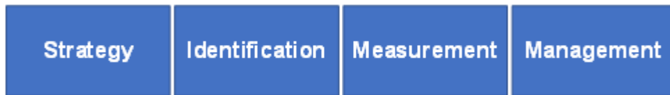
Exhibit 2: The SIMM Pillars

The key principles in the Framework are anchored on four pillars: Strategy, Identification, Measurement, and Management (“SIMM”).